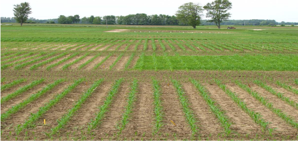
Figure 1. Photo of population and stress experiment at Elora with plots of increasing weed stress and soil compaction.