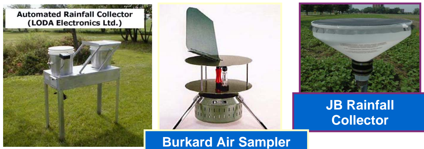
Figure 2 – The rainfall and airborne spore detection equipment used in the Canadian soybean rust spore detection network.

2) The establishment of both sentinel and mobile plots allowed us to survey for other soybean pests such as Soybean Cyst Nematode, aphids, viruses and other diseases. Unlike 2007, soybean rust infection was not detected in 2009 on either soybeans from sentinel plots or commercial fields. To date the only confirmed Canadian detection of a plant infected with soybean rust occurred from plots on the University of Guelph Ridgetown Campus in Ridgetown, Ontario, Canada in the fall of 2007. This detection was important since it confirmed that the disease can travel and infect Ontario soybeans.