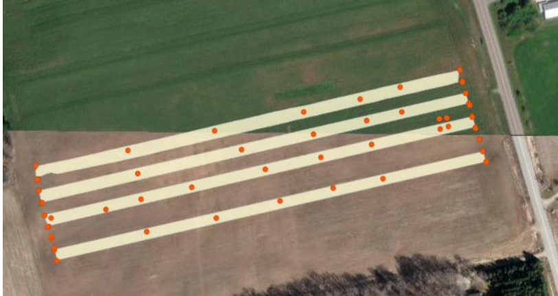
Figure 1. Plot set-up at the Brantford 2018 site. Each strip was marked and all samples and counts were taken from the same five geo-referenced locations (red dots) along the length of each strip throughout the season.

Yield was the average load value for the full length of each treatment strip, based on values from a calibrated yield monitor at St. George 2017 & 2018 and Brantford 2018 sites. Yield values from the Lambton 2018 site were based on individually weighed loads from each strip.