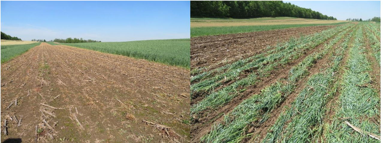
Figure 2. Early vs. late-terminated rye strips at the Brantford 2018 site before (left) and after (right) planting. May 25, 2018.

At the site with the greatest amount of rye biomass, Brantford 2018 (Figure 2), allowing an extra two weeks of growth resulted in over 8 times more plant material. Extra biomass contributes to building soil organic matter faster and provides a long-lasting mulch.