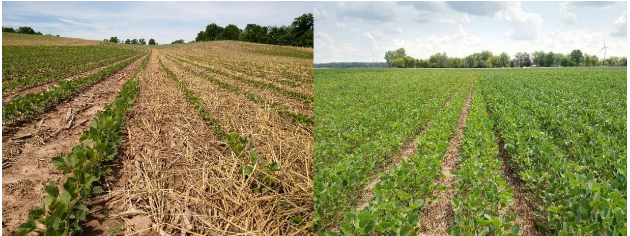
Figure 5. Soybeans at the Brantford 2018 site on June 26 (left). Soybeans planted green into rye were one growth stage behind and shorter than those planted into early terminated rye. At the Lambton 2018 site on July 31 (right), soybeans planted into early terminated rye (right-hand side of photo) were taller and one growth stage ahead.

**Soybean seeding depth was accidentally not adjusted to account for depleted soil moisture in late termination plot