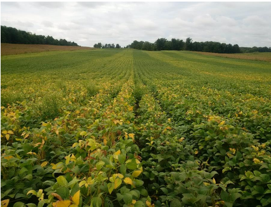
Figure 6. Soybeans in early-terminated rye (left) had a much greater density of Canada fleabane than soybeans planted green into rye (right) at the Brantford 2018 site.

Effects on weeds were not evaluated in depth. However, a greater density of Canada fleabane was observed in early-terminated strips at the Brantford 2018 site (Figure 6). At this site, the herbicide program did not include a product with good efficacy on glyphosate-resistant Canada fleabane. Upcoming on-farm research will evaluate the impact on weeds of early and late-terminated rye compared to no rye cover crop.