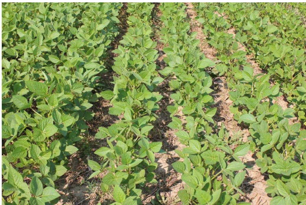
Figure 3 Tufted vetch control with glyphosate + 2,4-D Ester 700 applied pre-plant