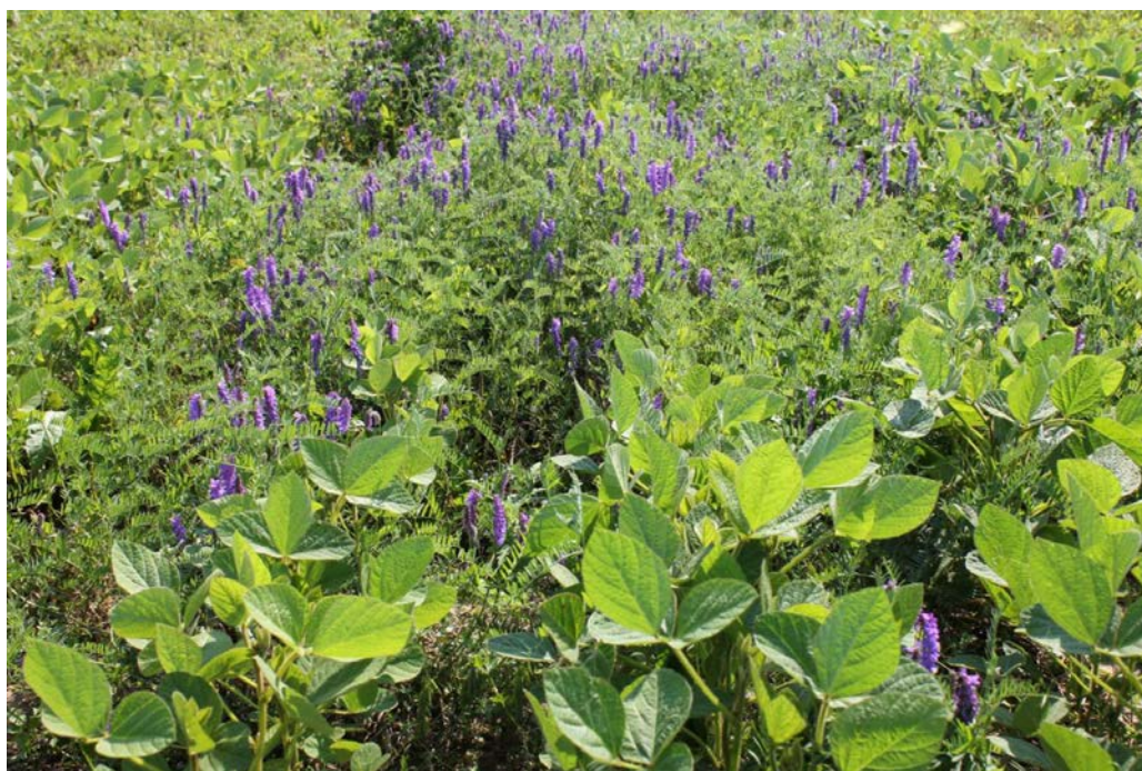
Figure 2 Tufted vetch control with glyphosate applied pre-plant