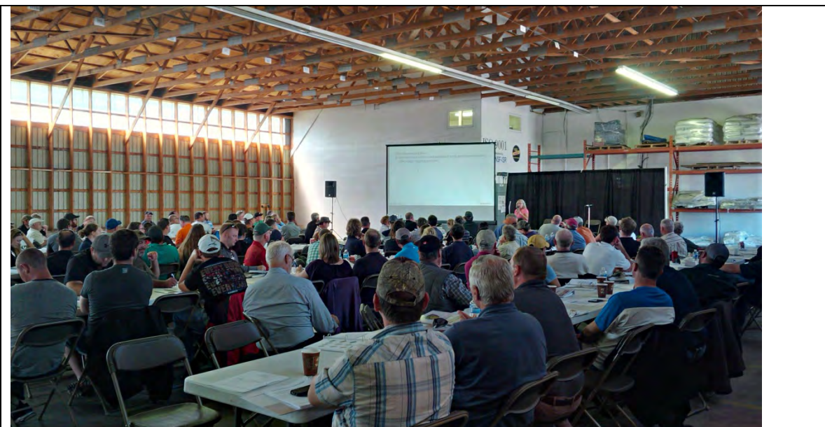
Figure 4. Learning Tips and Tricks on How To Manage Precision Ag Data.