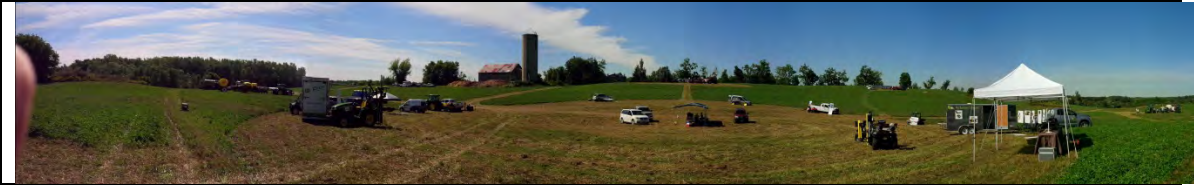
Figure 2. All the Equipment and Resources to Make Site Specific Management Work were in Attendance at ZoneSmart.