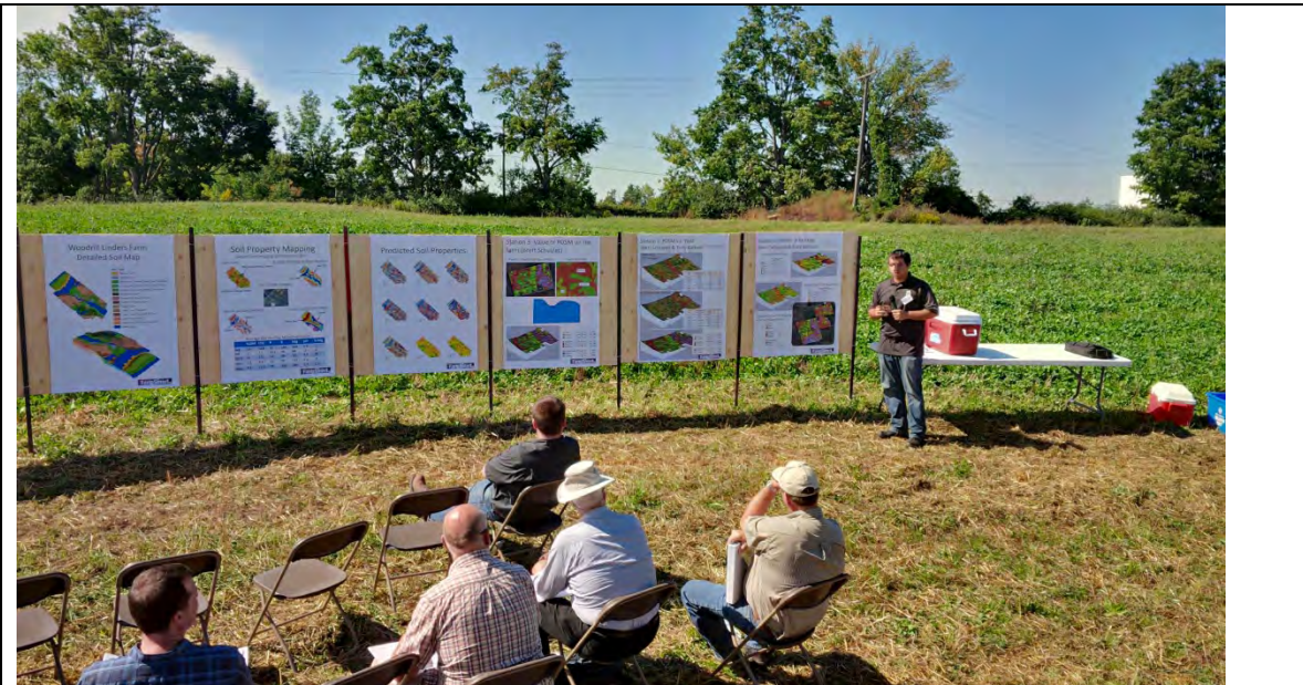
Figure 3. Learning about Digital Soils Mapping Derived from Elevation and Soils Data Layers.