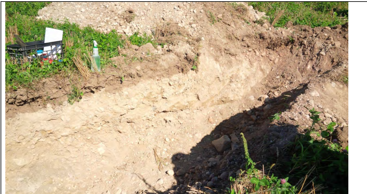
Figure 6. Checking Out the Variability of Soil from the Soil Pit and Understanding how it Impacts Management Zones and Prescription Allocation.

The committee looks forward to hopefully being able to continue with a ZoneSmart Event in 2016. Stay tuned!